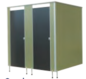
toilet & shower partitions